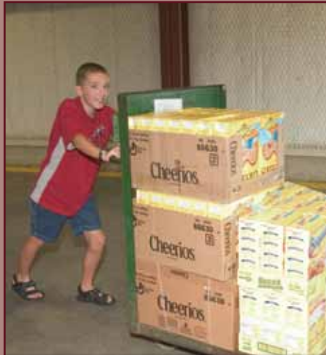
Cash donations keep our warehouse full of great food for those in need