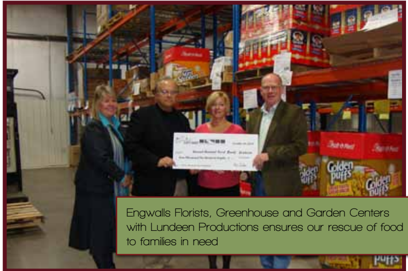
Engwalls Florists, Greenhouse and Garden Centers with Lundeen Productions ensures our rescue of food to families in need