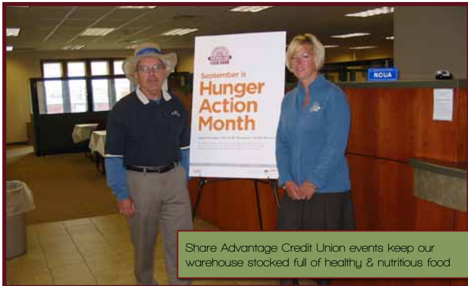
Share Advantage Credit Union events keep our warehouse stocked full of healthy & nutritious food